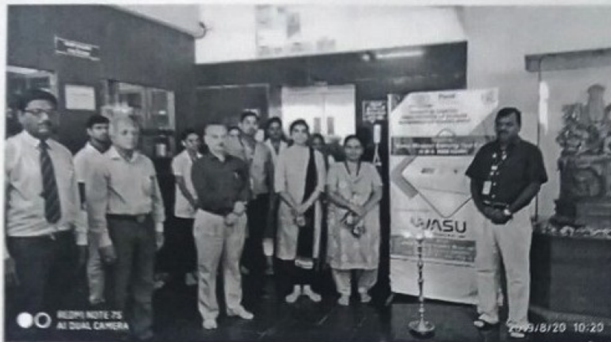
Inaugural function of BMD camp

PARUL UNIVERSITY PARUL INSTITUTE OF AYURVED WAGHODIA, VADODARA