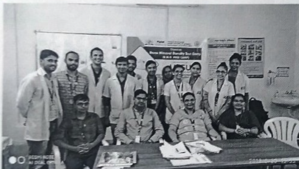
Kriya Sharir department in group photo